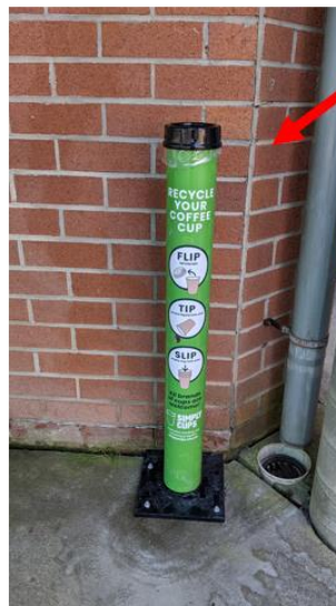
Outside of the staff room

Lids and straws go in the tube on the right.