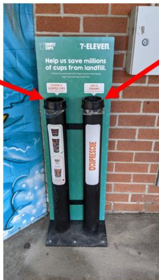
Outside of the canteen

Students can recycle their empty paper cups from hot chocolates and slushies in the cup rescue tube on the left.