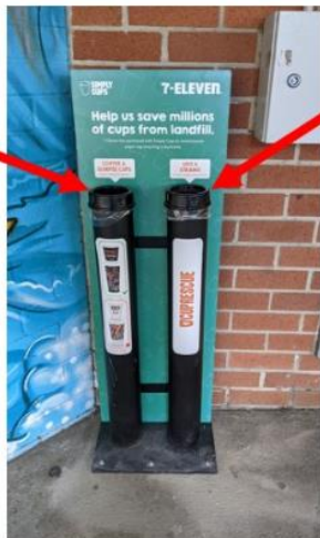
Outside of the canteen

Students, staff and parents/carers can recycle their empty paper cups (no lids) from coffees and slushies in the cup rescue tube on the left.