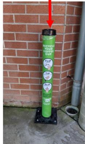
Outside of the staff room

Teachers and parents/carers can recycle empty paper coffee cups here (no lids please).